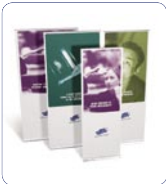
Available in four widths.