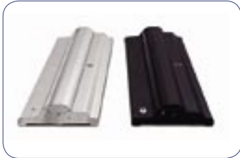
Select the colour according to the message.