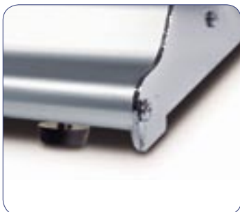
An adjustable screw compensates for uneven floor surfaces.