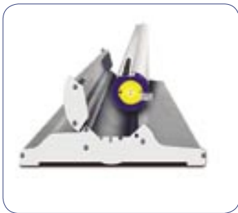
The banner is well protected during transport.